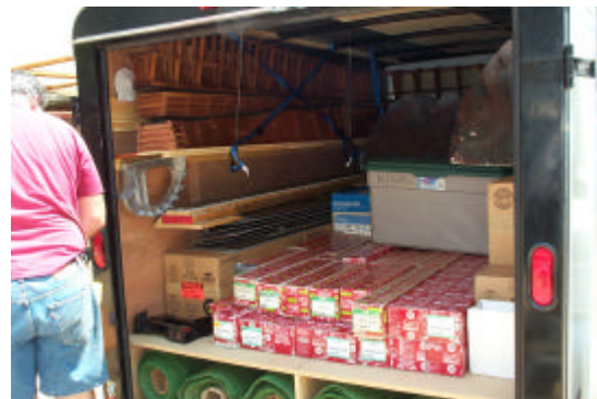
Photo at right shows the trailer partially loaded. Track, equipment and boxes in center, over and under sections stored on shelves around the walls.